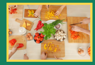
Cooking Class Learn more on page 2.